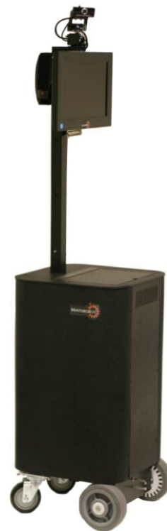
plugged into Skype™

The MantaroBot requires no supervision or operation by onsite members, excluding initial power-on. Onsite participants are able to communicate with the offsite user through an onboard microphone, speaker, display, and camera. The Robot is based around a netbook computer that manages the peripherals. The MantaroBot is Wi-Fi enabled and communicates with a wireless router. Skype or your choice of audio/video conferencing application runs on the netbook providing high quality audio and video. A control interface runs on the user’s computer allowing full control of the MantaroBot and completing the video call-in platform. The MantaroBot also features a pan tilt camera that provides wide visual range and acuity.