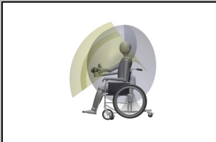
Workspace: Side View